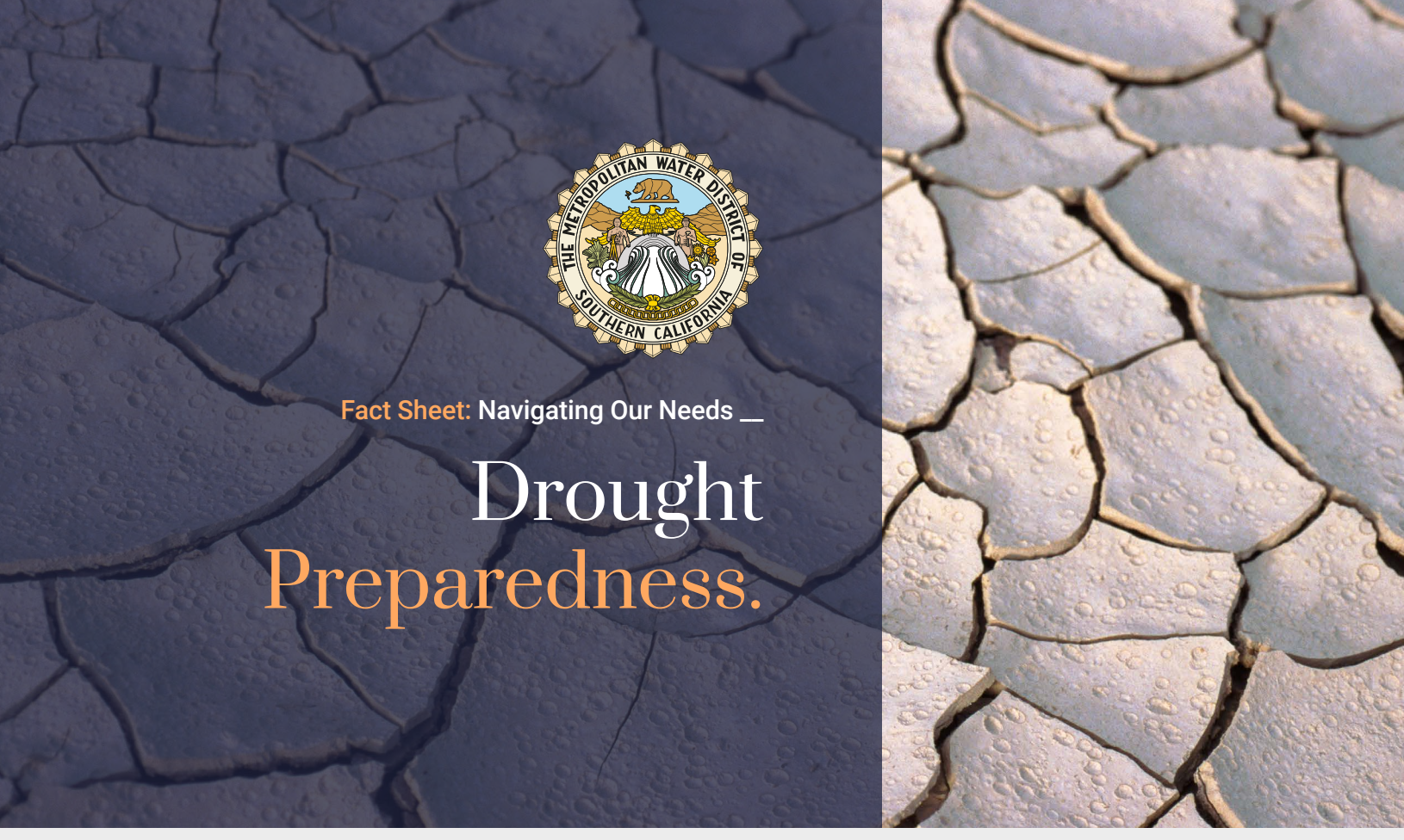
Photo: A dry streambed, circa 1991, mirrors conditions we see over and over as drought cycles return more frequently.