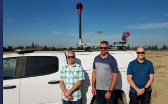
Field Survey Team