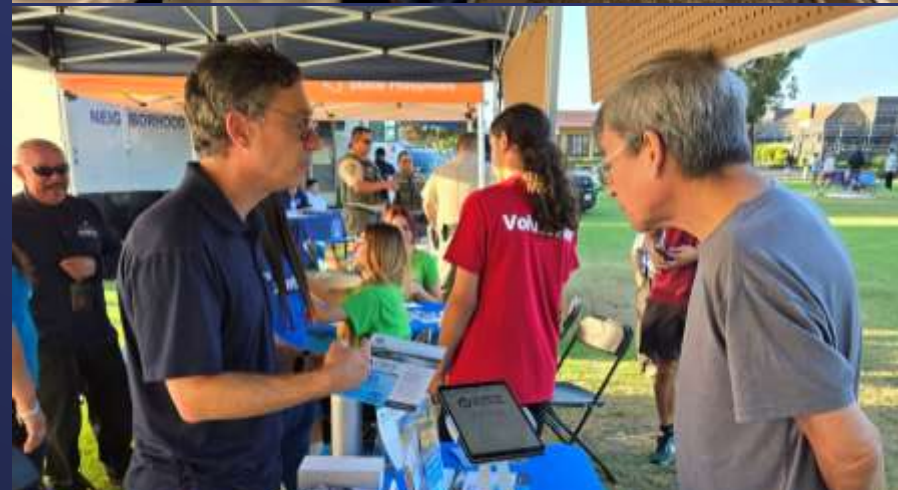
Norwalk Summer Park Concert