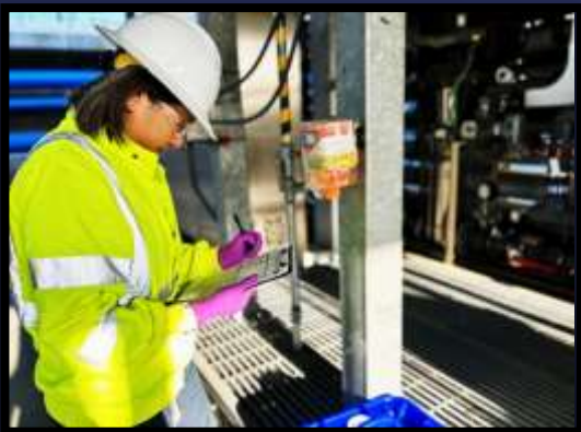
September 24, 2024