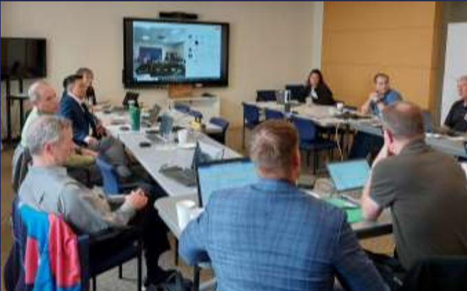
Value Engineering Workshop