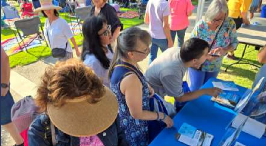
Lakewood Summer Park Concerts