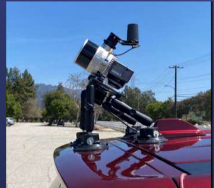
Mobile LiDAR Survey Equipment