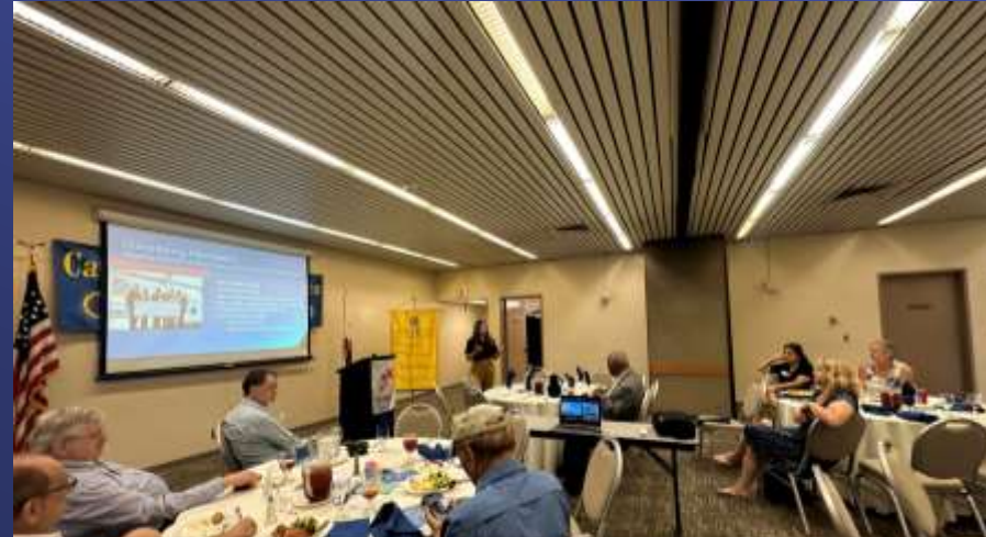
Carson-Gardena-Dominguez Rotary Club