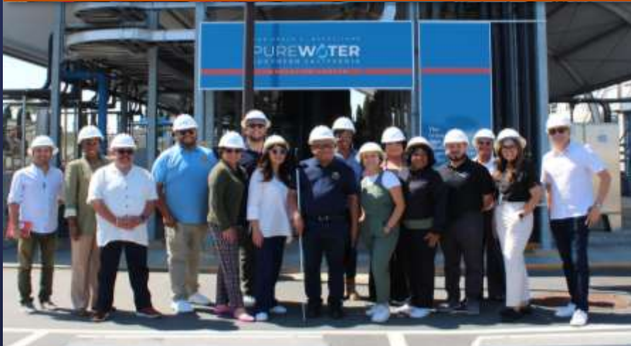
WELL UnTapped Fellowship Tour